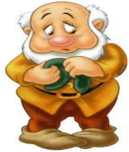
Christy Position: Dance Year: 2011