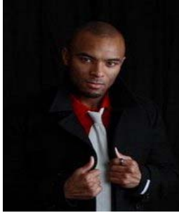
HB Position: Hip Hop Year: 2008